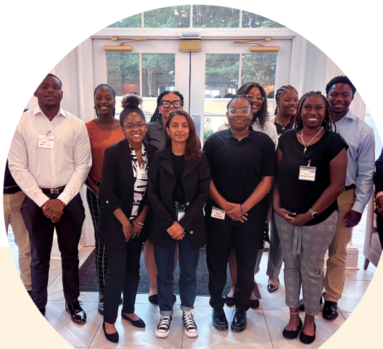
Ten students from six Historically Black Colleges and Universities participated in our HBCU S.O.A.R. Scholars Program.

Being our customers' local bottler is a big responsibility. That's why we're committed to creating a work environment that puts the people behind the bottle—our One Team—first. We believe in investing in every Coca-Cola Consolidated Teammate , so we offer a comprehensive range of benefits, resources and special programs to help them grow and thrive throughout their careers. We celebrated our Team and provided them with several unique opportunities in 2023 to reinforce that mission.