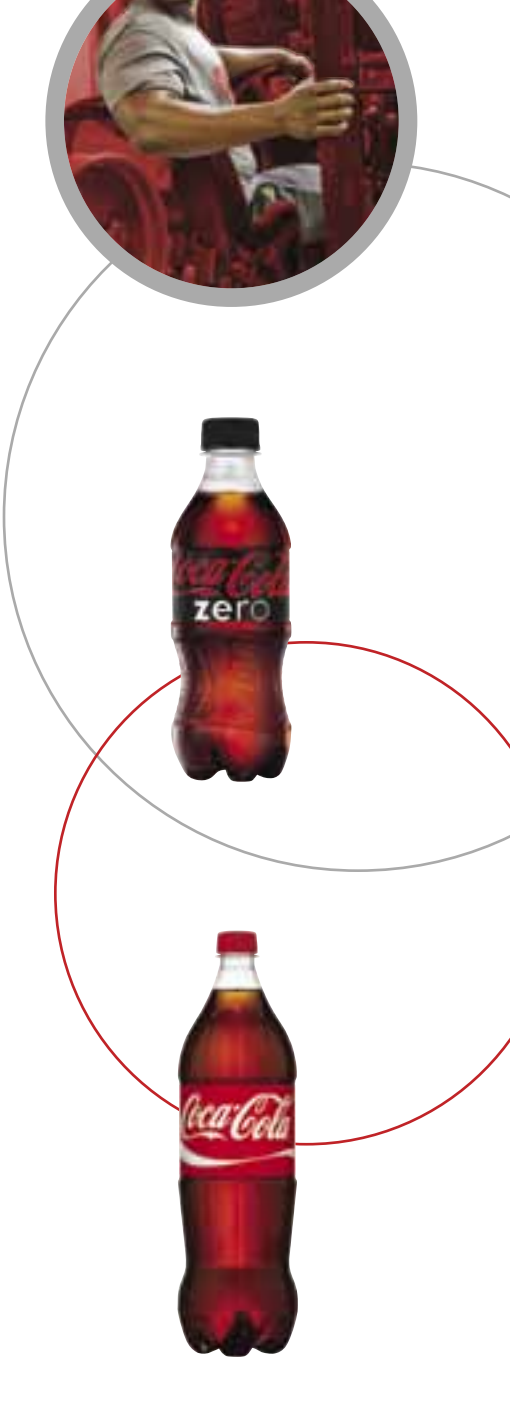
Dedicated employees and new packaging contributed to a solid 2011 performance.

The Company experienced significant increases in the cost of key raw materials in 2011, including sweetener, fuel and resin for our bottles. A combination of price increases and operating efficiency improvements helped offset the majority of these increases. We operate in a highly competitive consumer segment in which passing along increased costs is