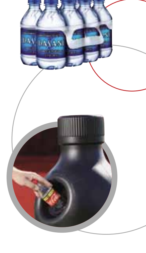
Sustainability initiatives extend throughout CCBCC.

In closing, we are pleased with our 2011 performance, which reflects the hard work of many and the strength of our