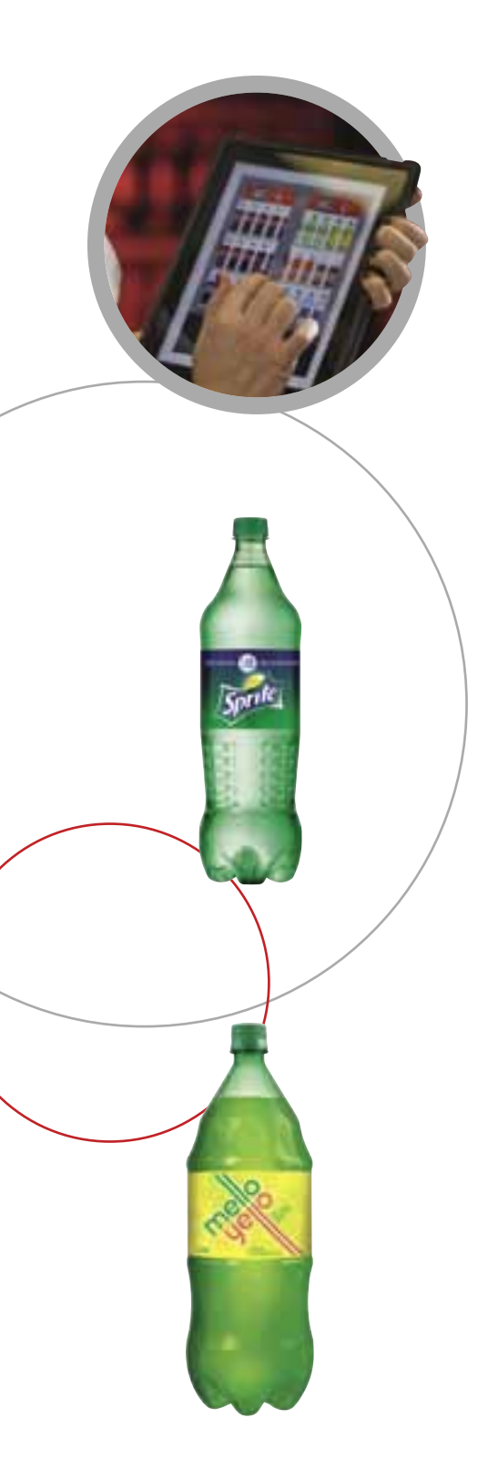
CCBCC is focused on innovation, consumer preferences and customer service.

extremely challenging. This magnifies the importance of continuing innovation to improve our supply chain and produce and deliver our products more efficiently. During 2011, we continued our process of consolidating distribution facilities to drive additional economies of scale. We further leveraged our transportation fleet, increasing utilization by expanding the scope of work we do for third parties.