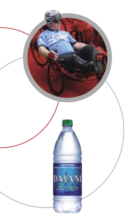
Our community involvement takes many forms.